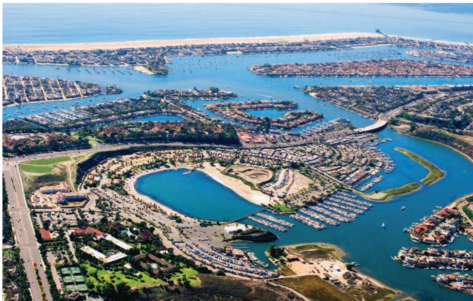
NEWPORT BEACH, CALIFORNIA

The Conference Sales team at Visit Newport Beach Inc. wishes you a warm welcome to Newport Beach — the ideal destination for your next meeting! Offering the best of all worlds — a tremendous variety of upscale accommodations; unique meeting venues of all sizes; a mild Mediterranean climate; unparalleled amenities, activities and attractions; and a stone's throw distance to Orange County/John Wayne Airport — Newport Beach is the destination guaranteed to please each and every guest in your group.