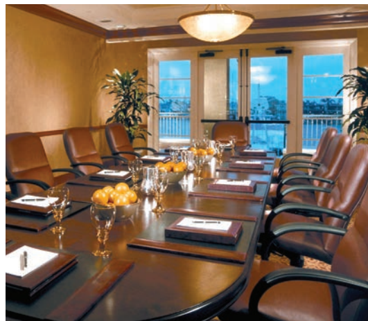
BALBOA BAY RESORT BOARDROOM

Newport Beach enjoys pride of place on the California Riviera, situated between Los Angeles and San Diego — an easy, approximately one-hour drive from either city — and within easy reach of all Southern California attractions, including Disneyland, Knott's Berry Farm, Legoland, and Universal Studios Hollywood. This idyllic location is convenient — serviced by three major airports — and provides lovely year-round weather, with an average temperature of 70 degrees. In addition to encompassing miles of spectacular coastline, pristine white sand beaches, a renowned yacht harbor, a picturesque nature preserve, and world-class golf courses,