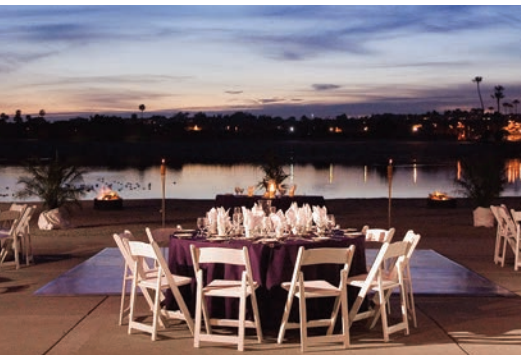
NEWPORT DUNES WATERFRONT RESORT & MARINA

Meeting planners seeking to wow attendees will be impressed by Newport Dunes Waterfront Resort & Marina. Gracing a scenic waterfront stretch of the Back Bay Nature Preserve, this 50,000 sq. ft. resort can accommodate gatherings ranging from a grand tented affair, to team-building events enjoyed via water sports on the Bay.