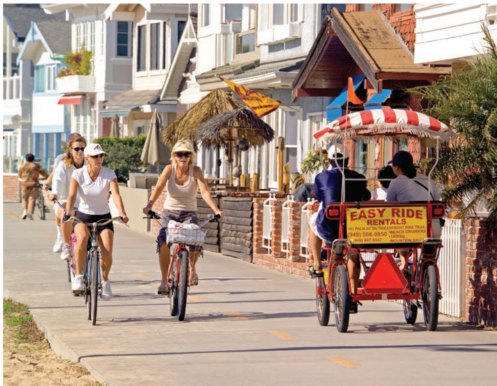
ACTIVITIES ON BALBOA PENINSULA BOARDWALK