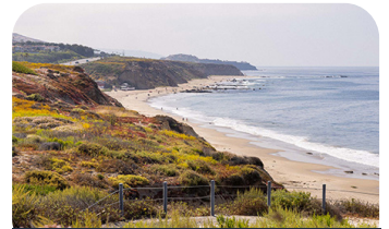
CRYSTAL COVE STATE BEACH

Take the stairs down to Pirates Cove, a coastal hideaway where scenes from Gilligan's Island were filmed.