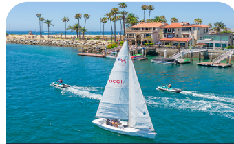
CORONA del MAR

Come during the summer and fall to catch the highest surf.